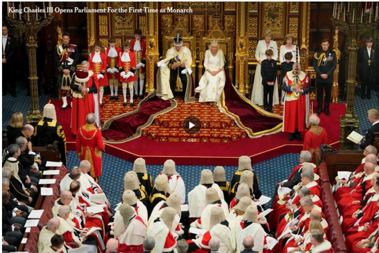
King Charles outlined the British government's legislative priorities during his opening address of Parliament.

17 juil. 2024 - Members of the House of Commons listened to the King's Speech during the State Opening of Parliament in the chamber of the House of Lords at the Palace of Westminster.