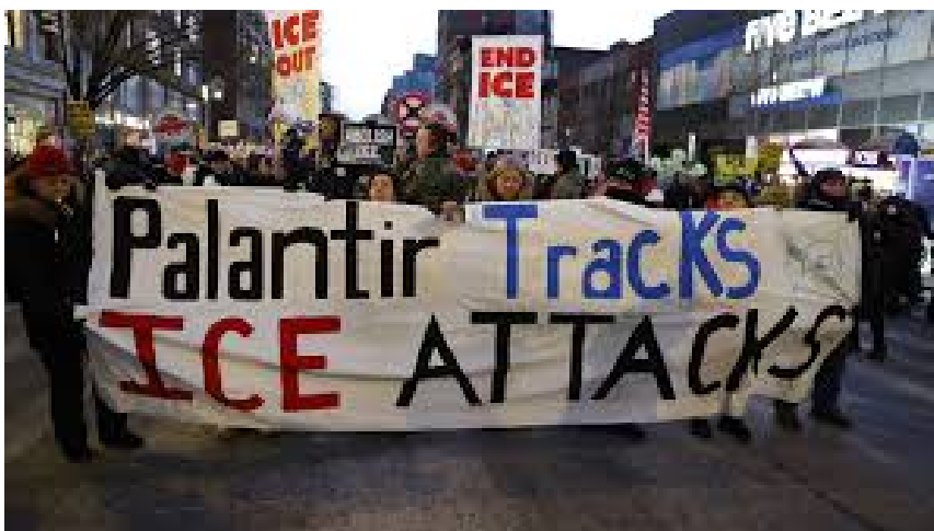
People participate in a protest in solidarity with Minneapolis and against US President Donald Trump and US Immigration and Customs Enforcement (ICE) in New York City on January 23, 2026.

Years and Years — BBC series (2019) near-future British drama Imagines the UK in 2024-2034 : detention camps for migrants, facial recognition everywhere, a far-right politician rising to power. Key themes : normalisation of surveillance, UK immigration policy, technology and authoritarianism.