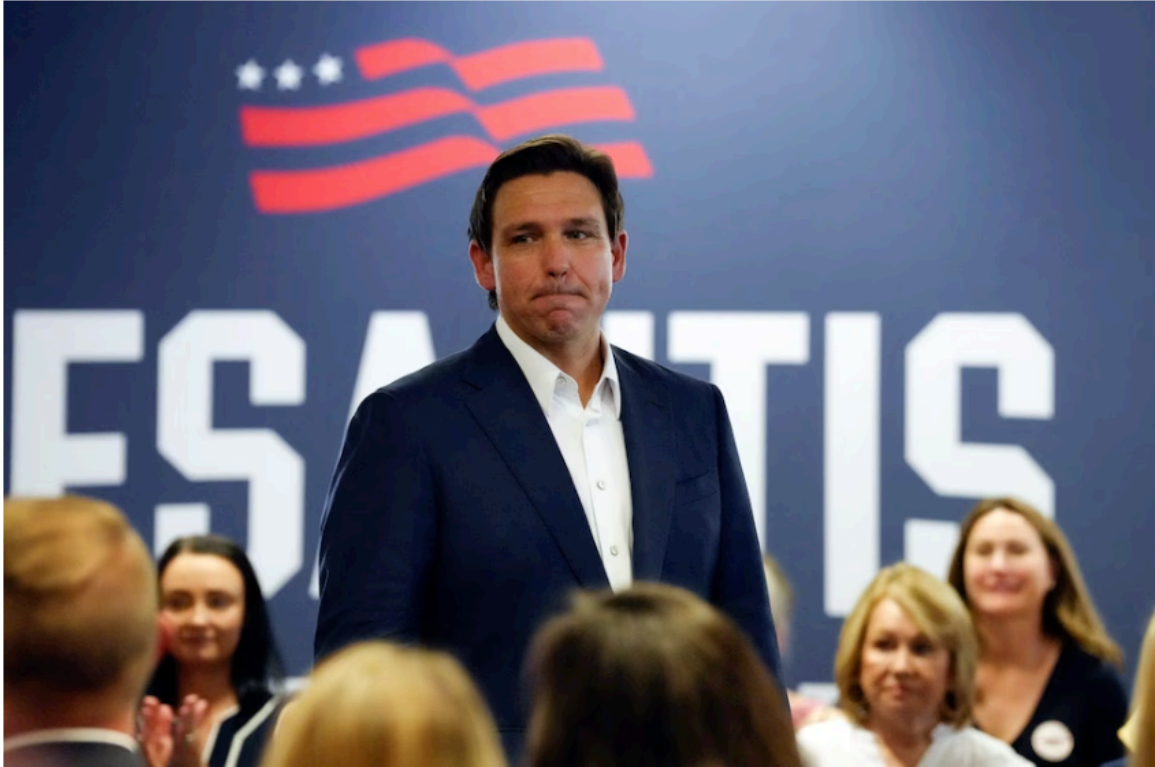
Florida Gov. Ron DeSantis during a campaign event on July 17 in Tega Cay, S.C. He is drawing new criticism for his comments on slavery.