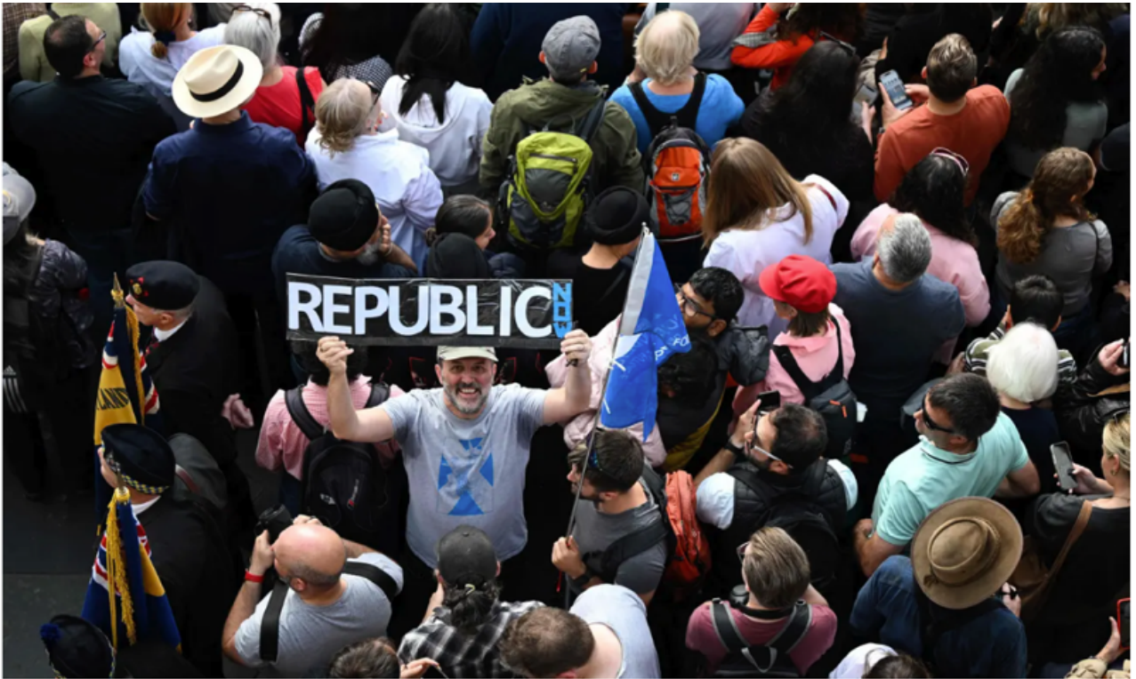
📷 A republican protester outside St Giles' Cathedral, Edinburgh, before the ceremony of proclamation for King Charles III.