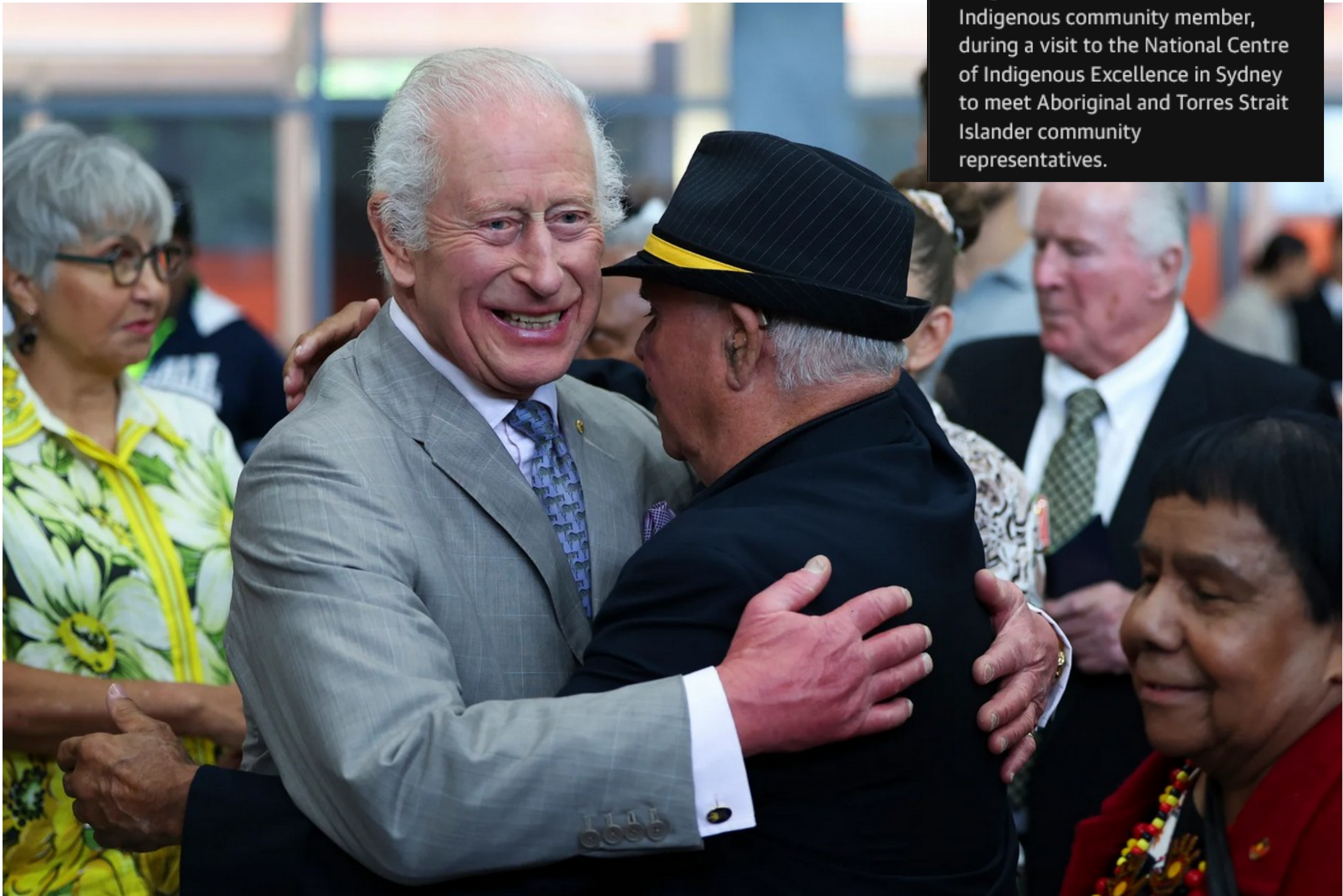
King Charles embraces an Indigenous community member, during a visit to the National Centre of Indigenous Excellence in Sydney to meet Aboriginal and Torres Strait Islander community representatives.