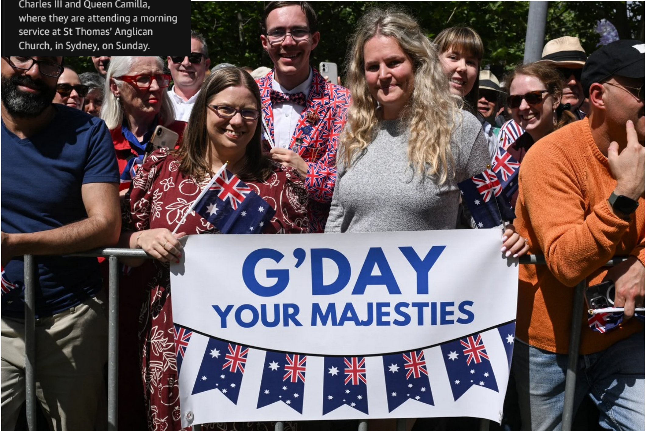
People wait to greet Britain's King Charles III and Queen Camilla, where they are attending a morning service at St Thomas' Anglican Church, in Sydney, on Sunday.