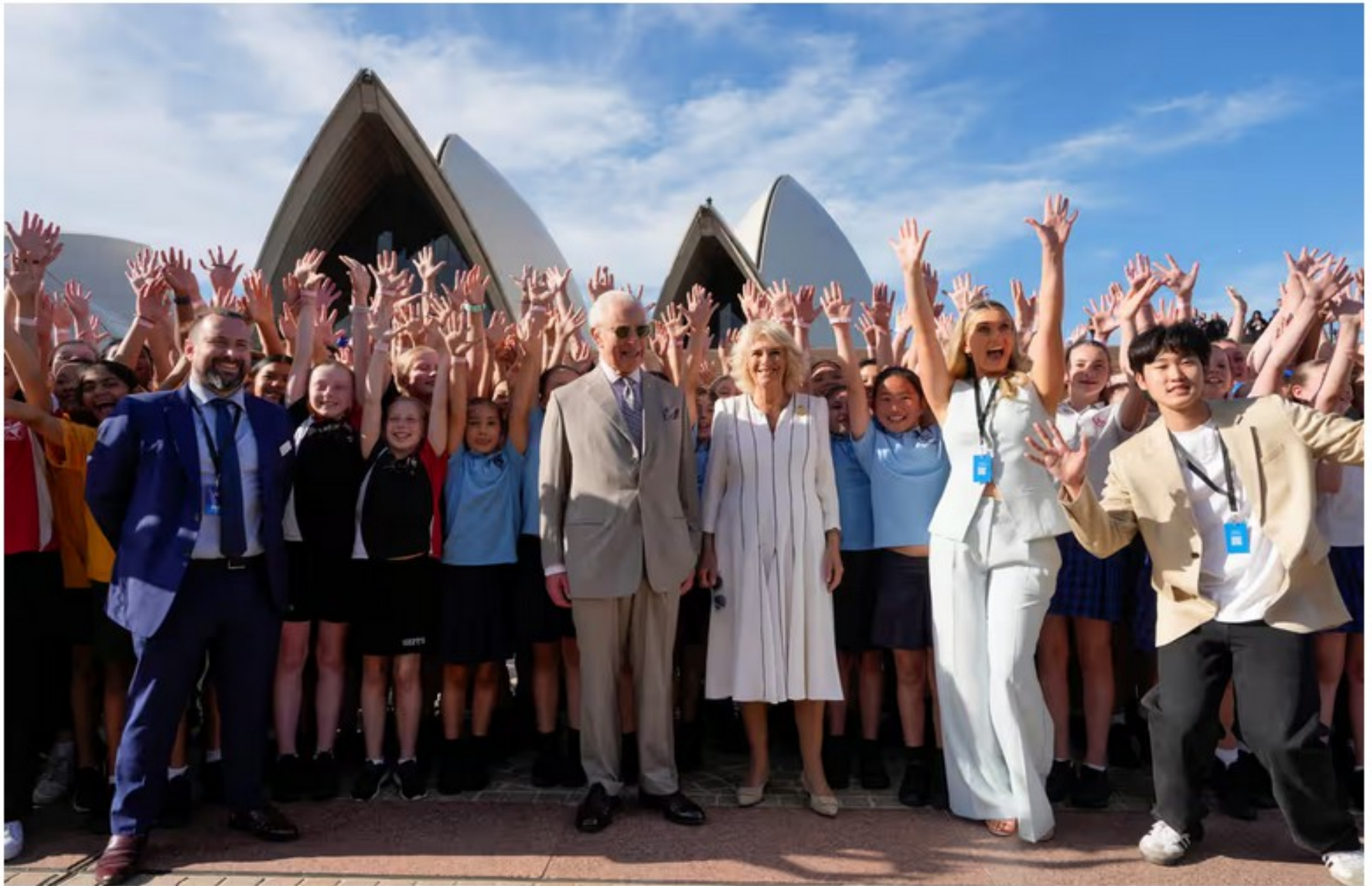
📷 King Charles III and Queen Camilla pose for a group photo during their visit to the Sydney Opera House on Tuesday.