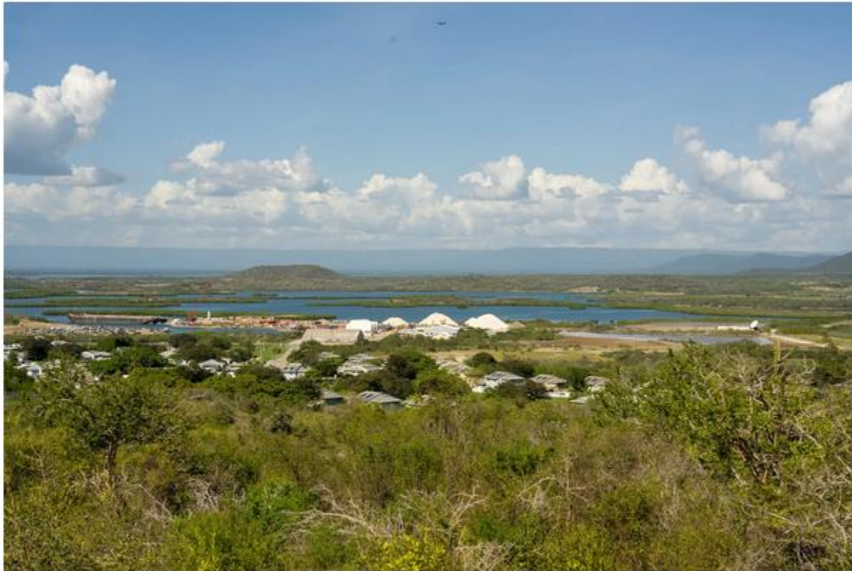
The U.S. Navy base at Guantánamo Bay, Cuba, in 2023.