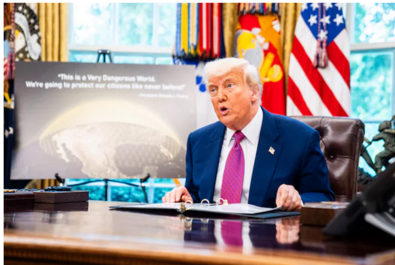
President Donald Trump discusses the Golden Dome missile defense system in the Oval Office on Tuesday.