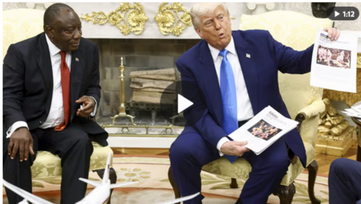
Donald Trump ambushes South Africa's president with video falsely claiming white genocide - video