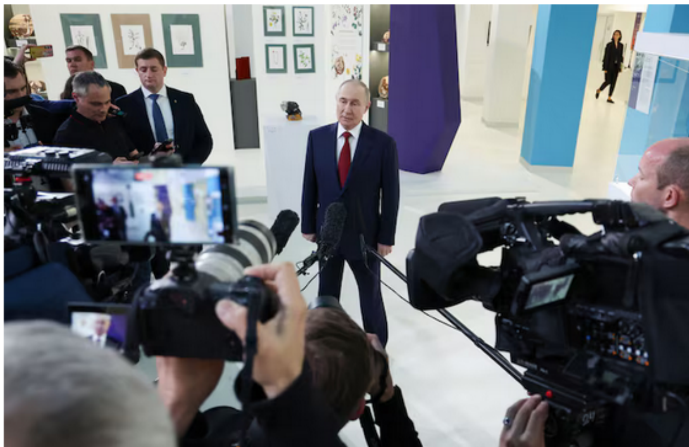
President Vladimir Putin speaks to reporters in Russia's Krasnodar region Monday after his phone call with President Donald Trump.