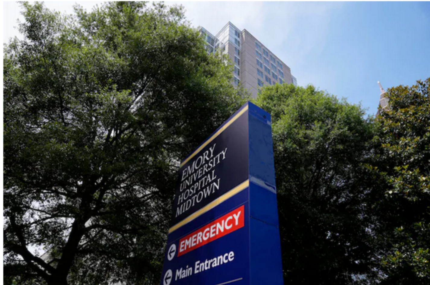
Emory University Hospital Midtown in Atlanta.