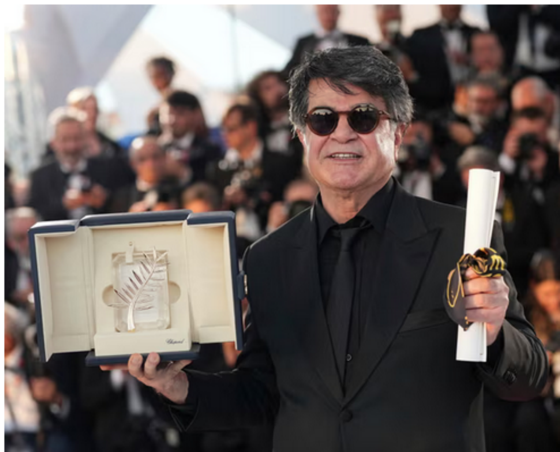
📷 Jafar Panahi with the Palme d'Or.