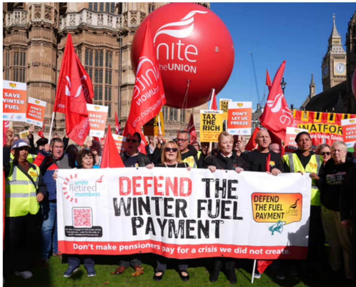
A protest against the decision to scrap the winter fuel allowance in Westminster in October.