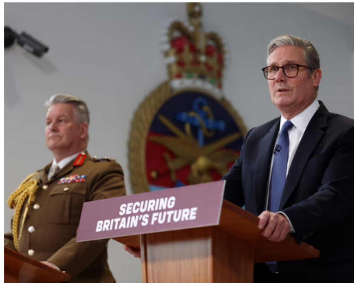
Keir Starmer, with Gen Sir Jim Hockenhull, said it was 'one of the most significant contributions that we make to our security relationship with the US'.